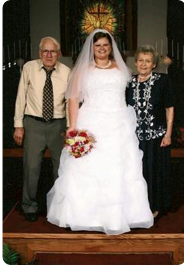
My wedding day with NaNa and PawPaw 05/31/08